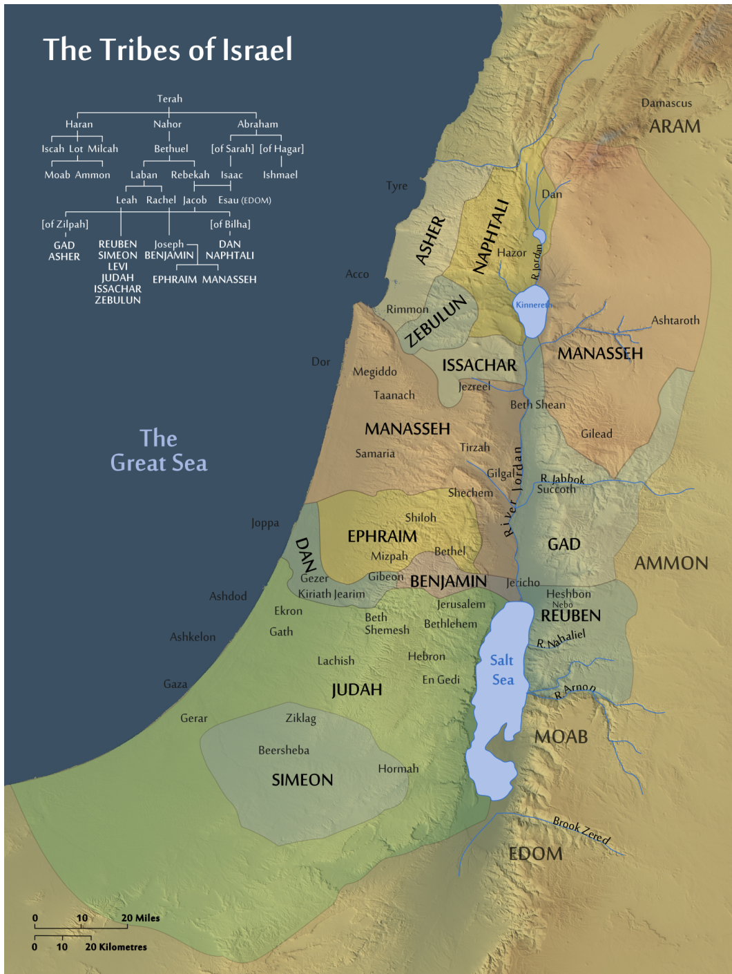
The Tribes Of Israel