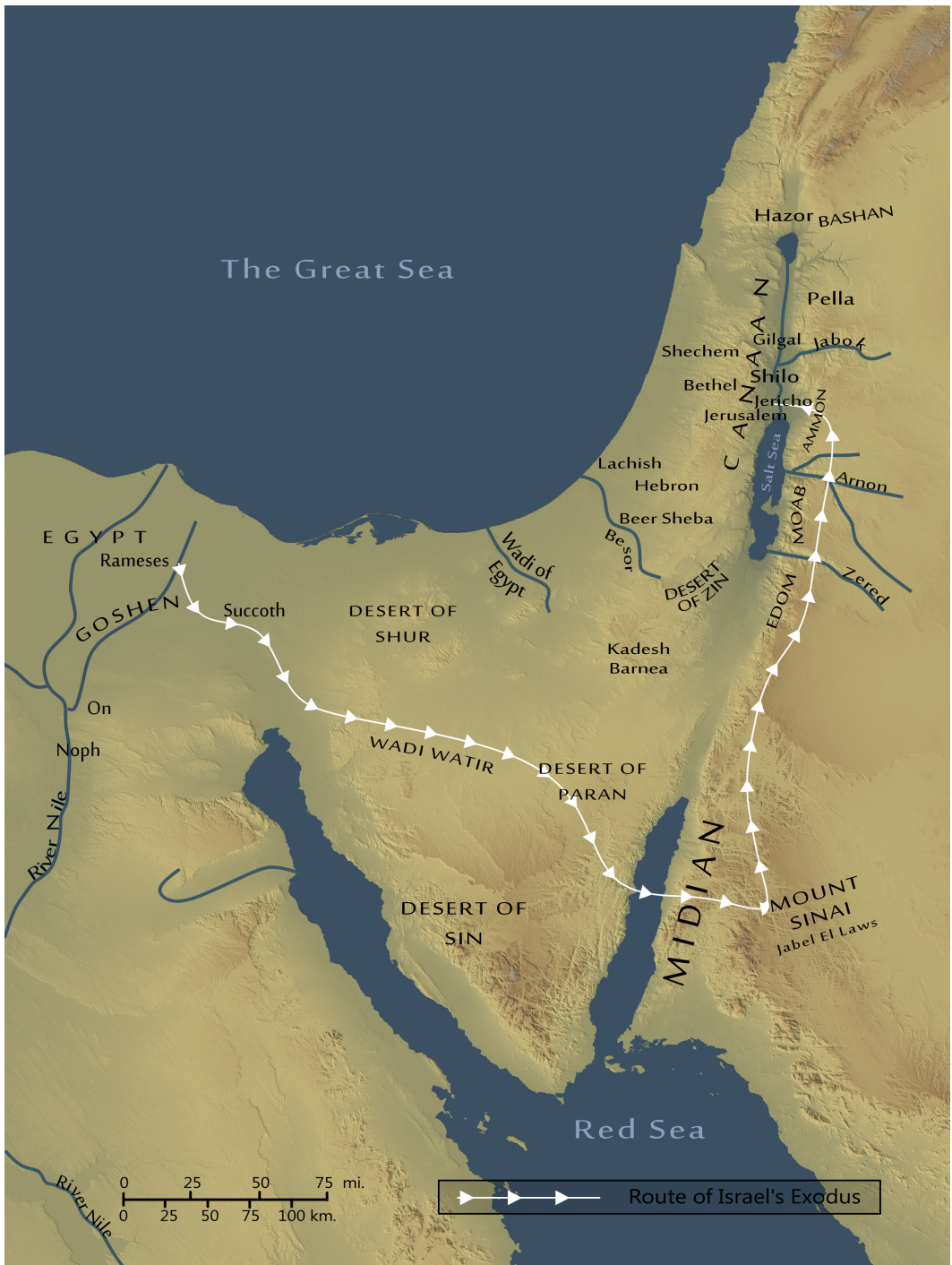
The Exodus Route