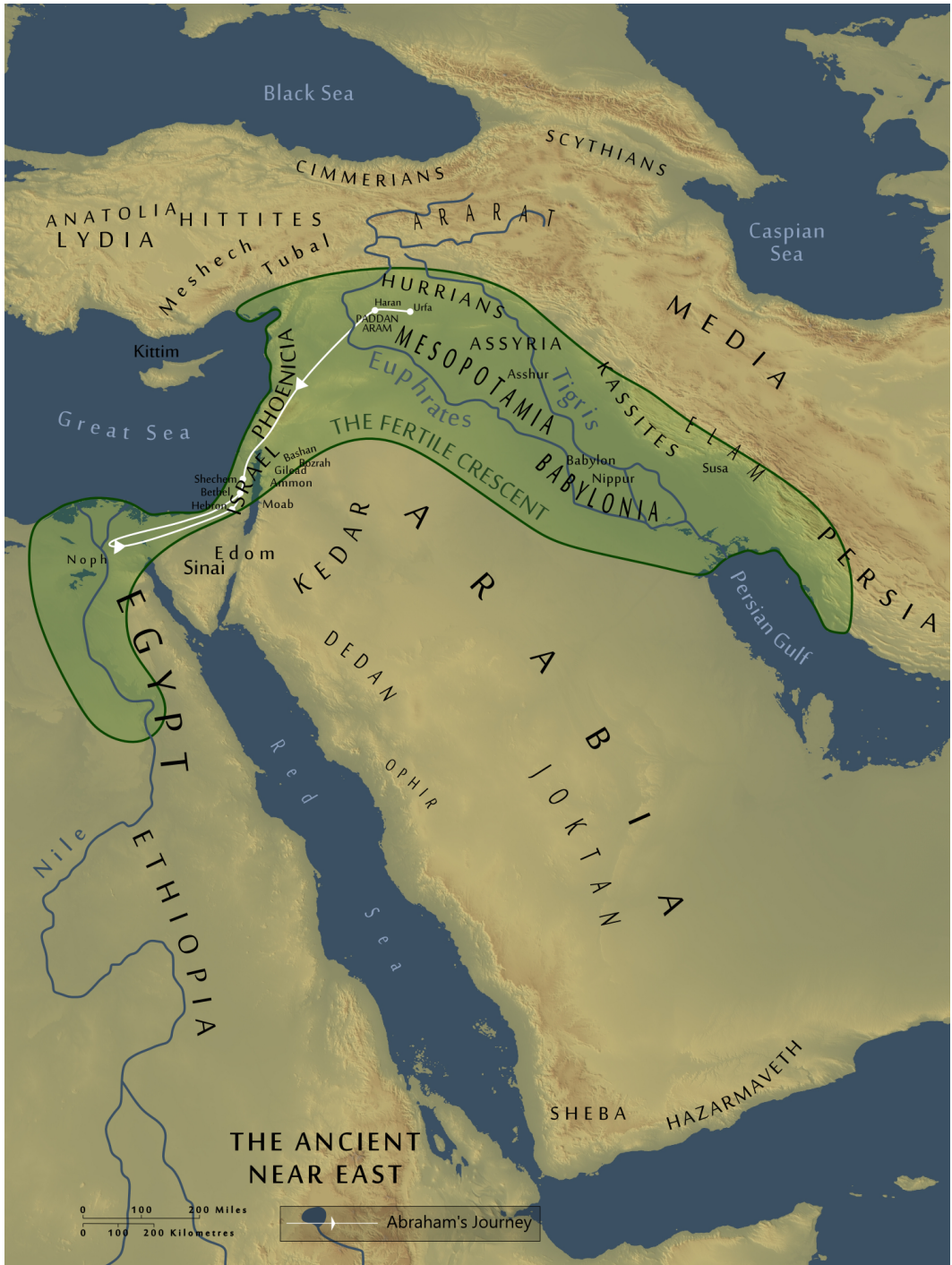
The Ancient Near East